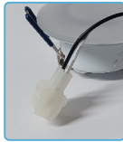
Light with plug